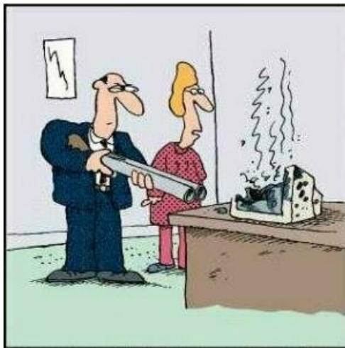
"There are better ways to log off."